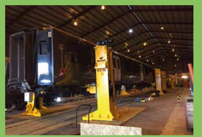
Class 321 on lift